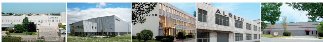
Milan ITALY Bernburg GERMANY Goncelin FRANCE Shenzhen CHINA Atlanta USA